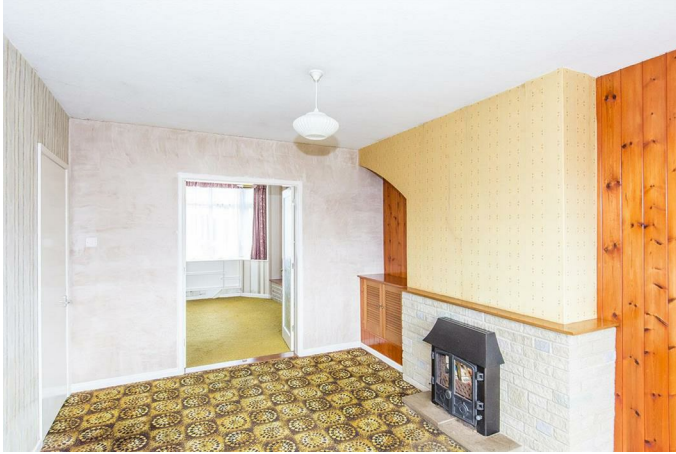
(Dining Room Photo Two)