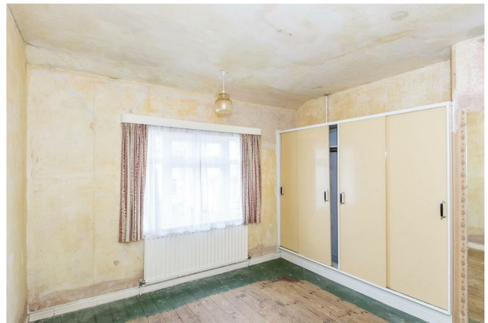
Bedroom One 11'11" x 9'0" (3.63m x 2.74m)

Double-glazed window to rear elevation. Radiator. Television point. Airing cupboard housing lagged hot water tank.