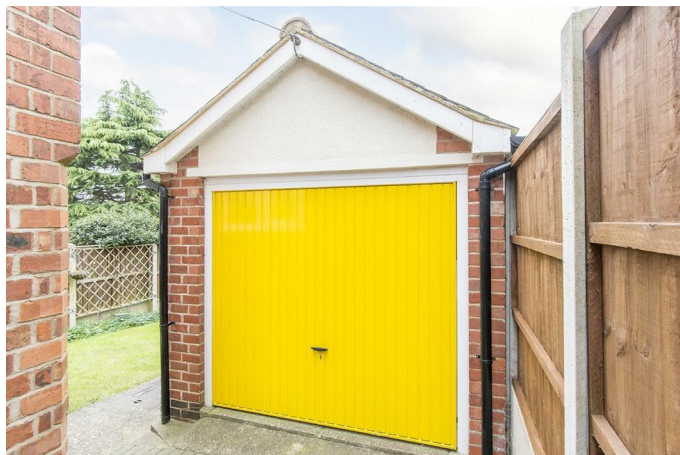
Garage 15'11" x 8'9" (4.85m x 2.67m)

Up and over vehicle access door. Power and light connected. Opaque double-glazed windows to rear and side elevations. Fitted work bench. Electric bar heater.