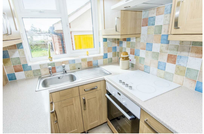
(Kitchen Photo Two)